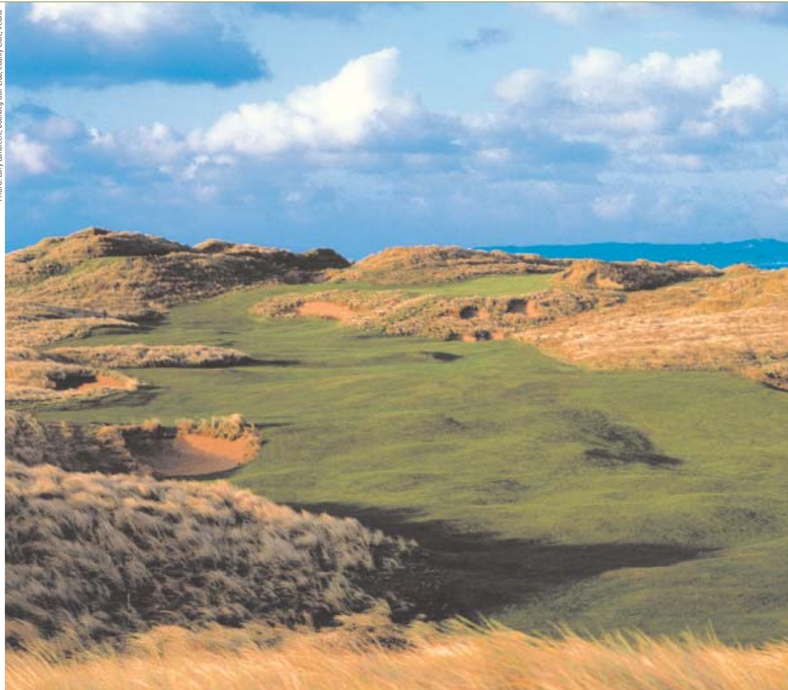
Doorbeg Golf Club, County Clare, Ireland