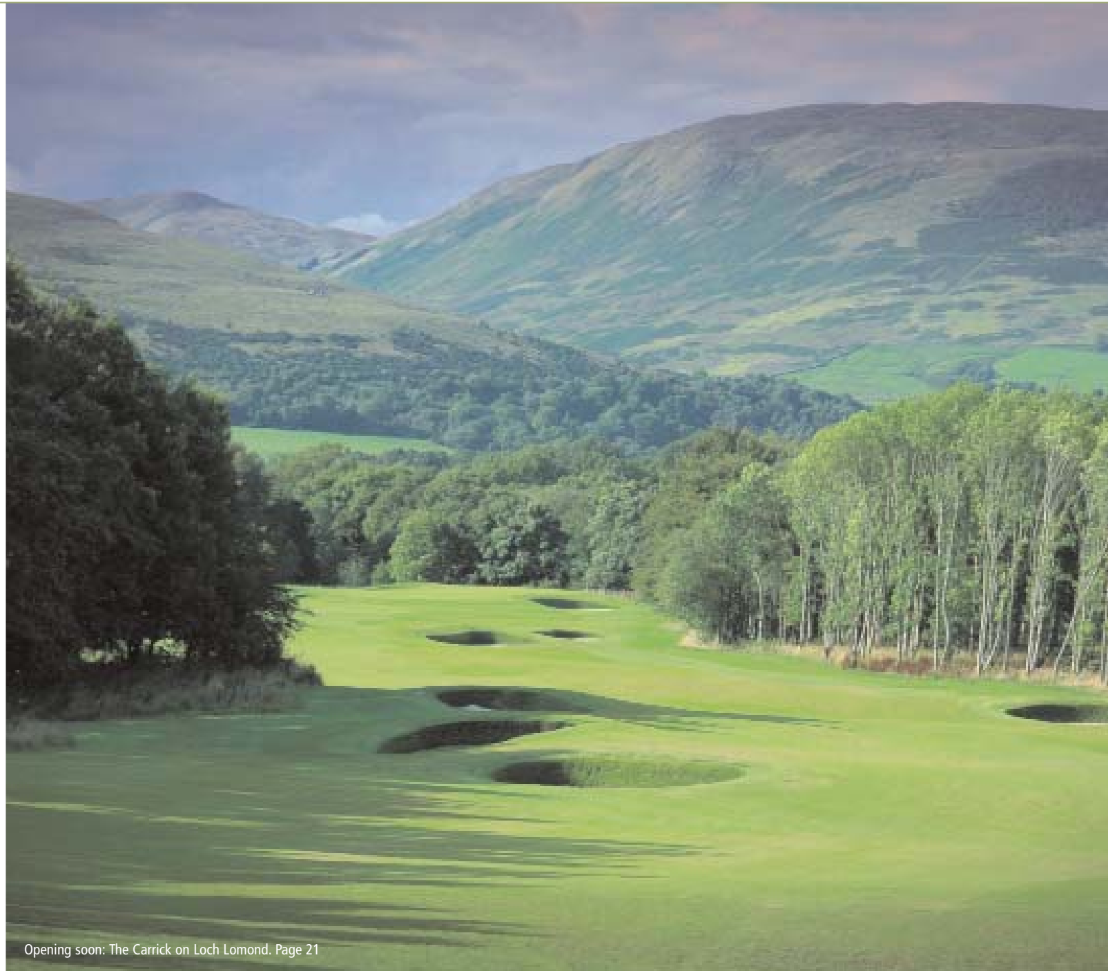
Opening soon: The Carrick on Loch Lomond. Page 21